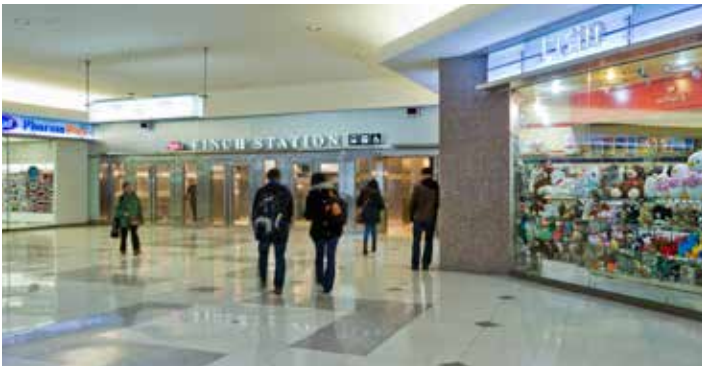
Entrance to TTC and GO Transit