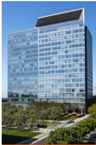
The Michelson, Irvine, CA