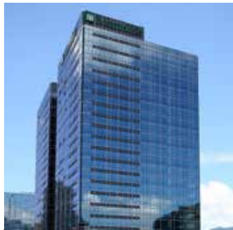
One Bay East, Hong Kong