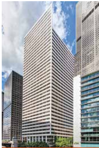
200 S Wacker Dr., Chicago IL