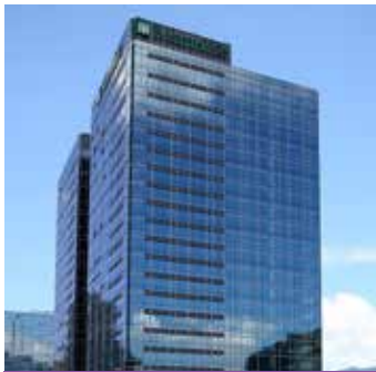
One Bay East, Hong Kong