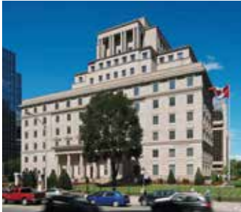
200 Bloor St. E., Toronto ON