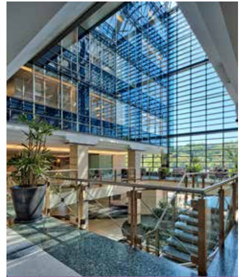
Two level retail atrium