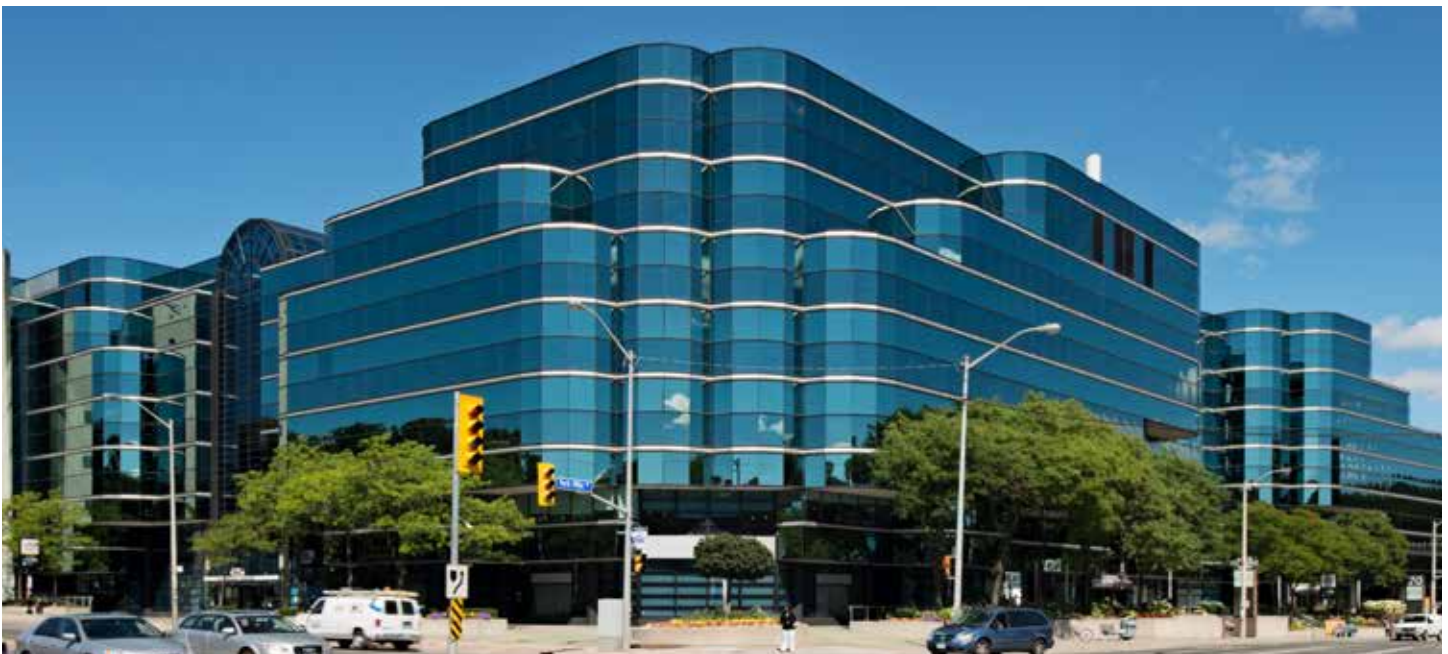
Exterior View of York Mills Centre at Yonge Street and York Mills Road