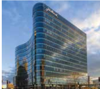
601 Congress St., Boston MA