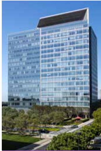
The Michelson, Irvine, CA