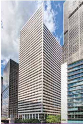
200 S Wacker Dr., Chicago IL